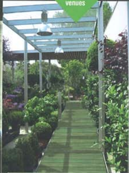
Open air venues

FINISHES: Chanfora (even installed) allows the combination of different finishes by the use of sun filters which provide an additional protection against the UV radiations.